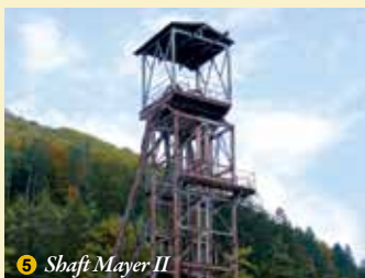
5 Shaft Mayer II