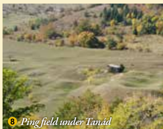
8 Ping field under Tanád