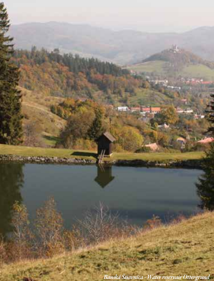
Banská Štiavnica - Water reservoir Ottergrund