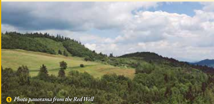
1 Photo panorama from the Red Well

The establishment of the Banská Štiavnica Geopark, a territory with an interesting and varied geological structure, dates back to 2000 . It is located on the territory of the district of Banská Štiavnica (Banská Štiavnica city and municipalities: Banská Belá, Banský Studenec, Baďan, Beluj, Dekýš, Ilija, Kozelník, Močiar, Počúvadlo, Podhorie, Prenčov, Svätý Anton, Štiavnické Bane and Vysoká), Žarnovica (municipality Hodruša - Hámre and Voznica) and Žiar nad Hronom (municipality Vyhne). It spreads over an area of 374 km 2 .