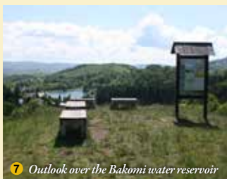
7 Outlook over the Bakomi water reservoir