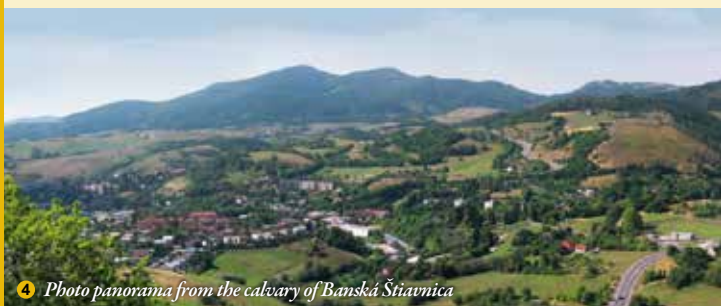
4 Photo panorama from the calvary of Banská Štiavnica