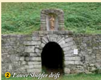
2 Lower Shopfer drift

The Protected Landscape Area of Štiavnické mountains interfere with its territory. Within the geopark, three information centres, two heritage drifts, four educational footpaths and a geological exposition are in operation. Part of the geopark's object system are also objects registered on the UNESCO World Cultural and Natural Heritage List „Historic Town of Banská Štiavnica and the technical monuments of the surrounding area“.