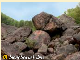
6 Stone Sea in Vyhne

in Prenčov. Since 2008, the management of already built elements of the geopark have passed into the competence of the Slovak Mining Museum, the State Nature Conservancy of the Slovak Republic and the municipality of Štiavnické Bane.