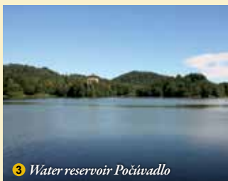
3 Water reservoir Počúvadlo